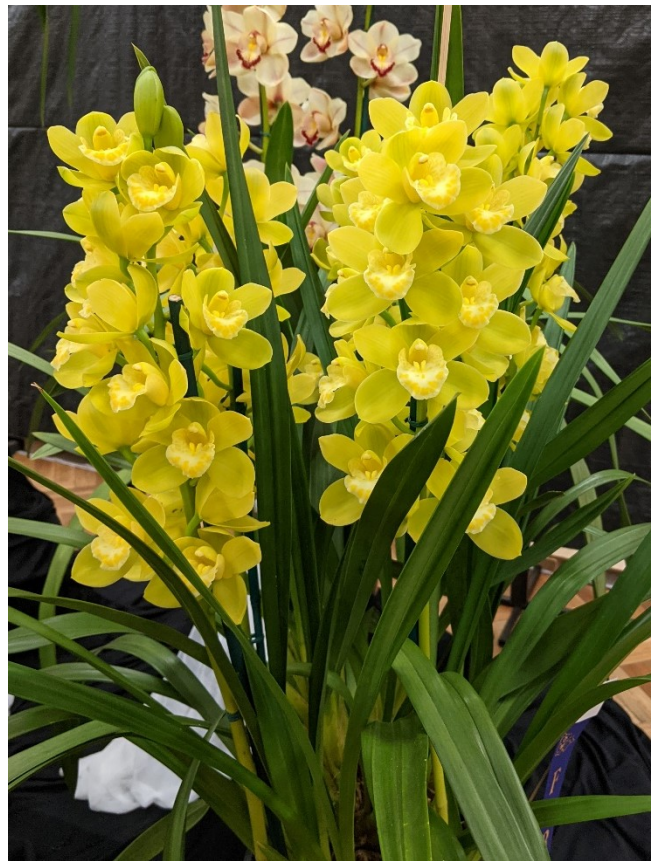
Cym. Blazing Dream 'HP' 1 st Place in Class 33