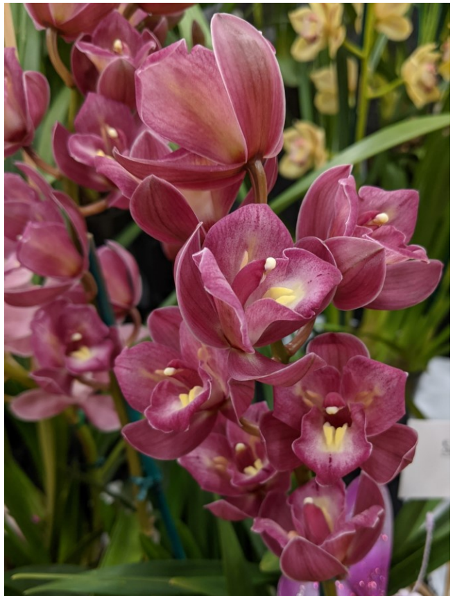
The unusual Cym. Sweet Wine 'Latour'.

I hope the reader has enjoyed this selection of photos from the show!