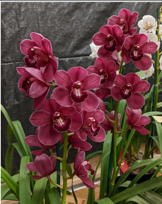
Cym. Regal Flames 'Queen of Hearts' 1 st Place in Class 7