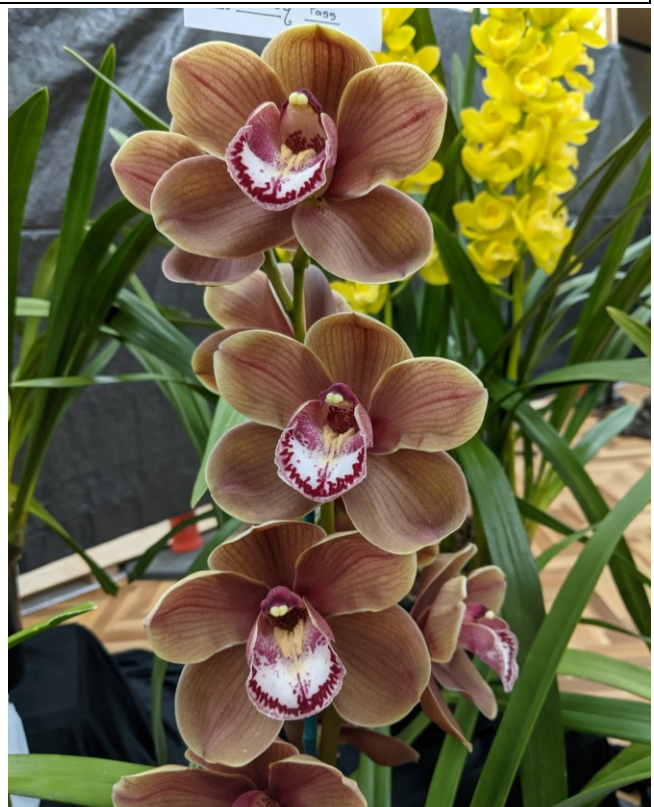
Cym. (Lunar Blaze X Kimberley Pass) 1 st Place in Class 9