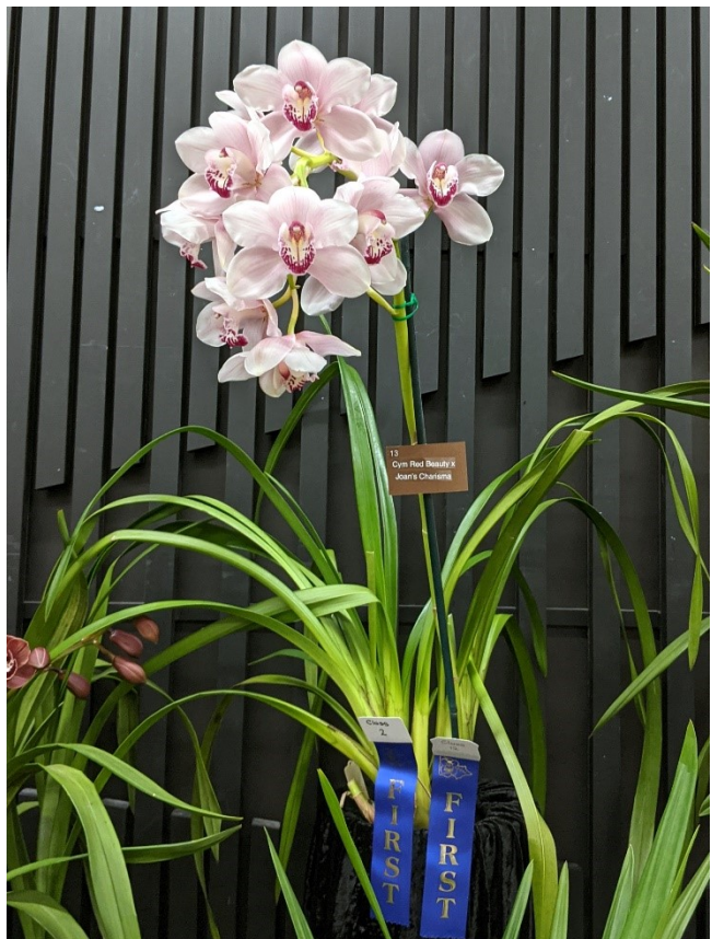
Cym. (Red Beauty X Joan's Charisma) 1 st Place in Classes 2 and 12