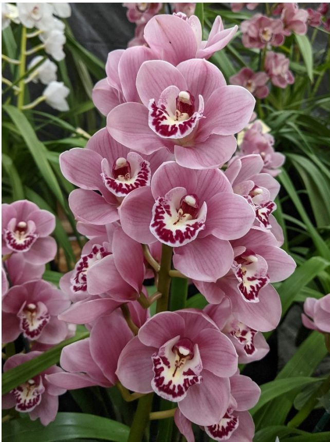
Cym. Khanebono 'Jacinta' Champion Intermediate and Champion Specimen