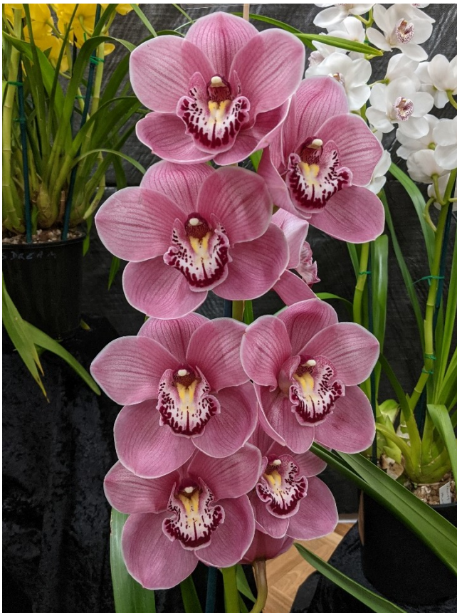
Cym. Regal Princess 'Bernice' Champion Large Flower