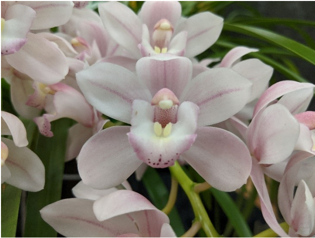
Cym. New Century 'Rosie Splash' 2 nd Place in Class 44