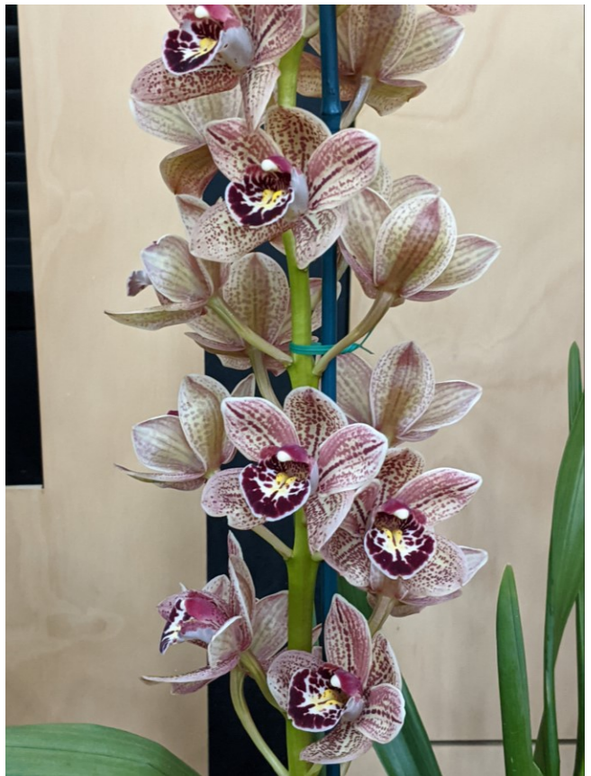
Cym. ((Teddy Roosevelt x Beaconfire) X Champagne Robin) 'Royale' 1 st Place in Class 38