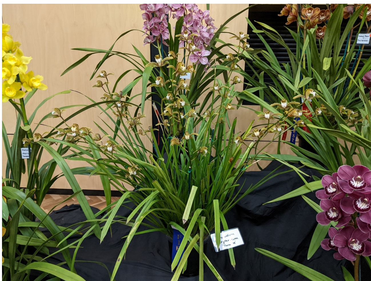
Cym. erythraeum var. flavum 'Paradise' Champion Species