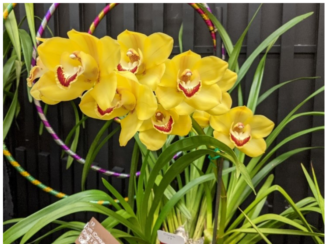
Cym. (Intense Gold 'Polaris' X Trinity Gold) 2 nd Place in Class 17