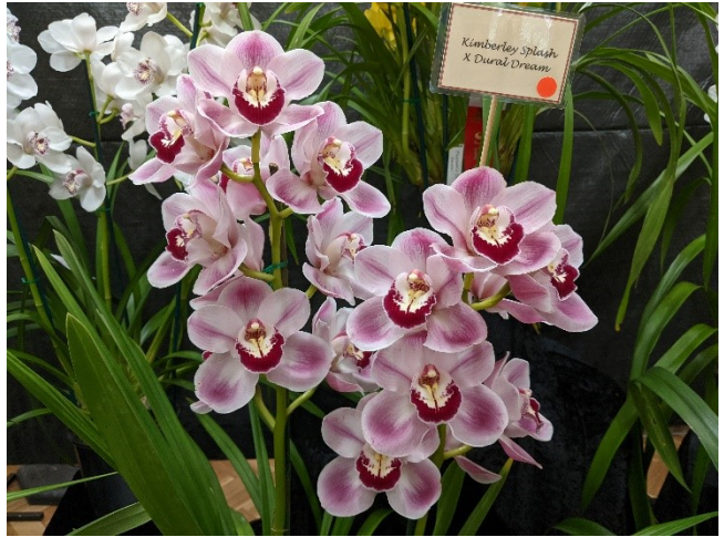
Cym. (Kimberley Splash X Dural Dream) 1 st Place in Classes 13 and 24