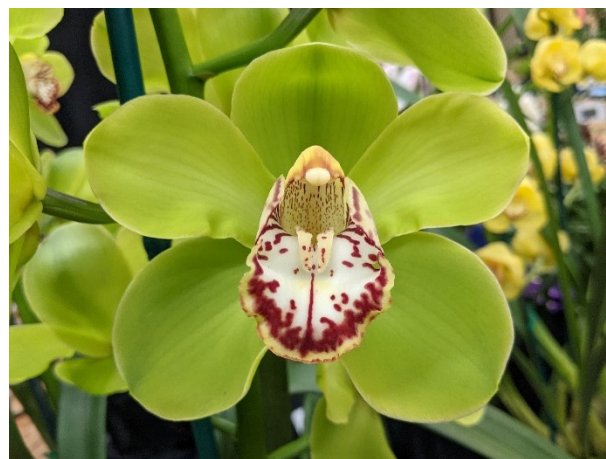
Cym. Kimberley Lagoon 'Argyle' 2 nd Place in Class 4