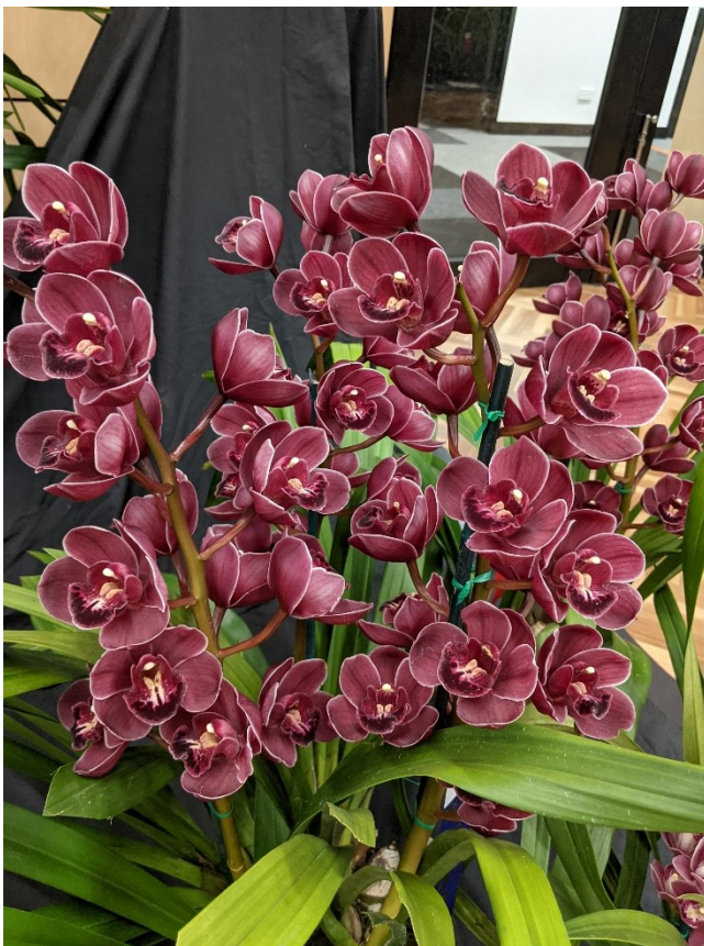
Cym. Nat's Pride 'No. 1' 1 st Place in Class 35