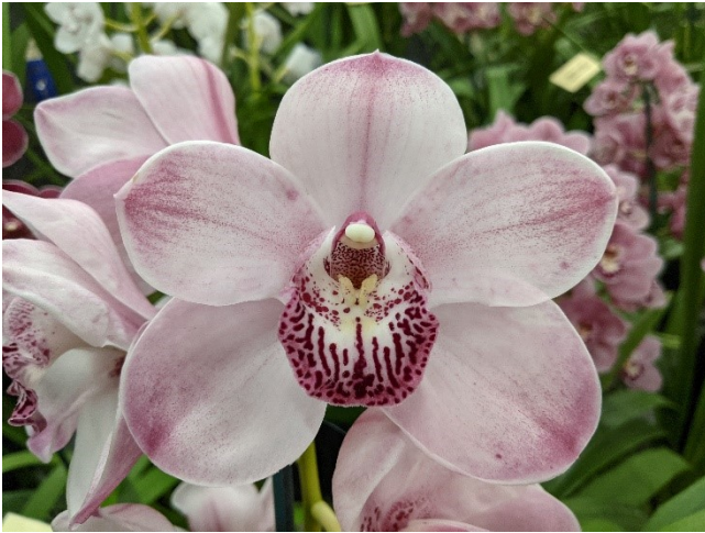
Cym. (Khan Flame X Kimberley Coast) 'Dusty Pink' 2 nd Place in Class 10