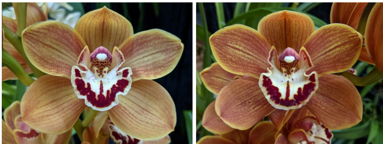
Two different divisions of Cym. Sundानी's Treasure 'Orange Crush' . One of these was 2 nd Place in Class 23.