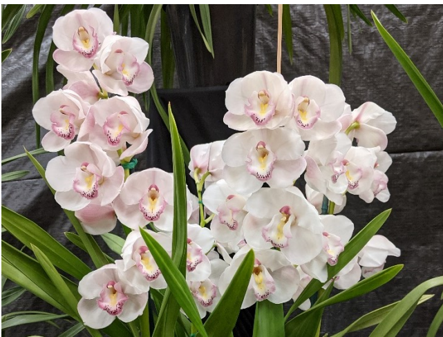
Cym. (Kuranulla 'Maestro' X Spring Flame 'Blushing') 1 st Place in Class 16