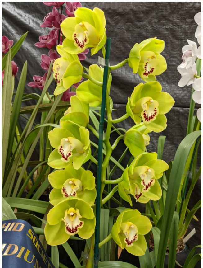
Cym. (Green Spectacle X Daintree) 'Tee Pee' Champion Small Standard