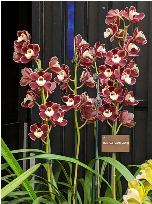
Cym. Red Pepper 'Janice' 1 st Place in Class 37