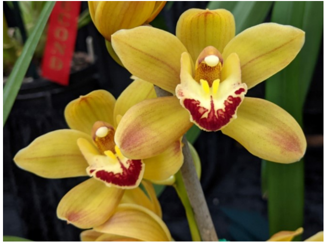
Cym. Latigo 'Cooksbridge Fantasy'

A few plants that I have not previously seen at the show (i.e., in the past 7 years) included New Century 'Rosie Splash', a mutant form of 'Rosie' that arose during the cloning process. The 1983 hybrid Latigo was another that made an appearance as well.