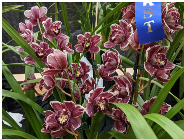
Cym. Winter Fire 'Frosty Tips' Champion Novelty