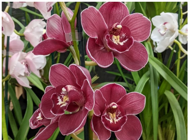
Cym. Red Nelly 'Red World' 1 st Place in Class 21

Two different plants of Sundaani's Treasure 'Orange Crush' were exhibited by Dennis Oliver. This grex is still often seen with its parentage (Pure Treasure X Red Beauty), despite having been registered in 2012. The two plants provided an example of the variation possible in colouration in this clone, which I expect are most likely due to growing conditions or a timing difference in when the spikes opened.