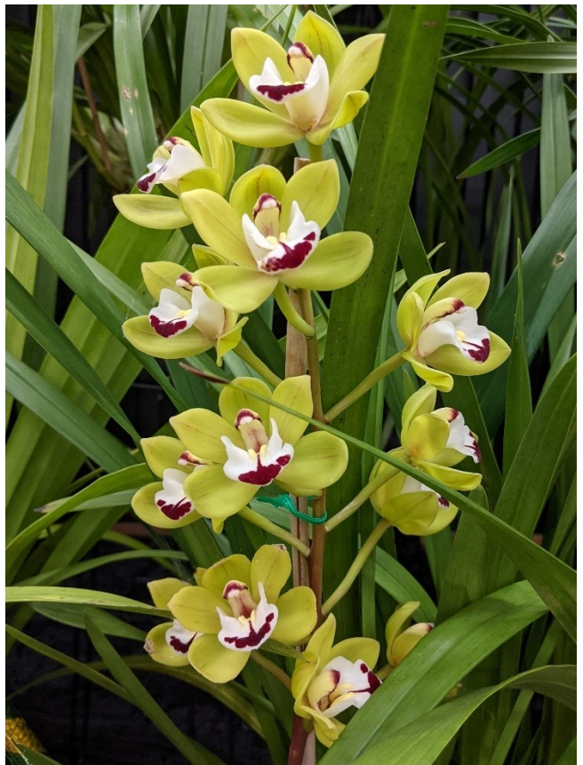
Cym. Thumbs Up 'Tamara' 2 nd Place in Class 46