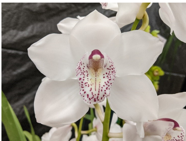
Cym. Kulnura Venus 1 st Place in Class 1

Sadly, examples in these latter two classes were particularly lacking, with only one of each exhibited. The full results from the show are provided over the next few pages.