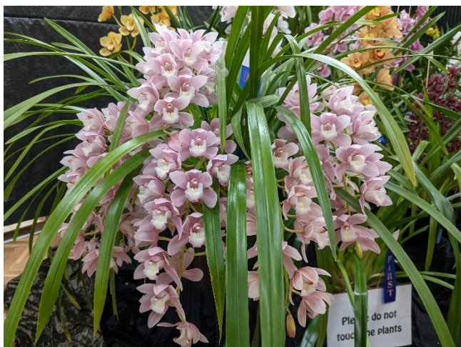
Cym. New Century 'Rosie' Champion Miniature