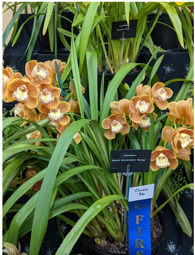
Cym. Drouin Masterpiece 'Renae' 1 st Place in Class 36