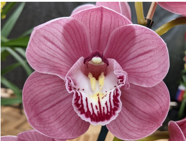
Cym. Blazing Beauty 1 st Place in Class 20