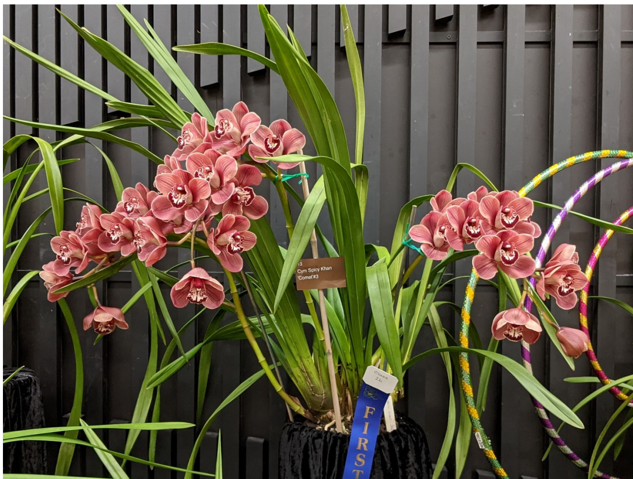
The larger of two divisions of Cym. Spicy Khan 'Comet' exhibited by Dennis Oliver 1 st Place in Class 26

Non-alba yellows were in the definite minority at this year's show, with no large standards or miniatures entered for judging and only one intermediate – Cym. One Tree Hill , a well-known grex that is nearing 35 years old. In fact, there were more alba (aka "pure colour") yellows awarded than non-albas (alba yellow intermediates seems to be the most popular of the various yellows). Even browns and oranges, which can be finicky colours to produce, were more numerous.