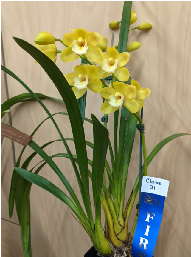
Cym. One Tree Hill 'Beenak' 1 st Place in Class 31