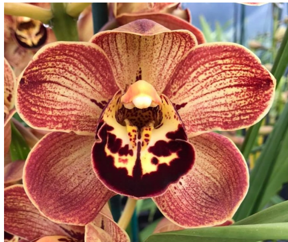
Cymbidium Mesmerise 'Looby Loo'

Welcome to this edition of Cymbidium Chatter. Unfortunately the news regarding the COVID-19 situation is not getting any better and I doubt that any Orchid Societies will be conducting Spring Shows. My own judging schedule has been wiped out, so I guess I'll just have to enjoy my own flowers this season.