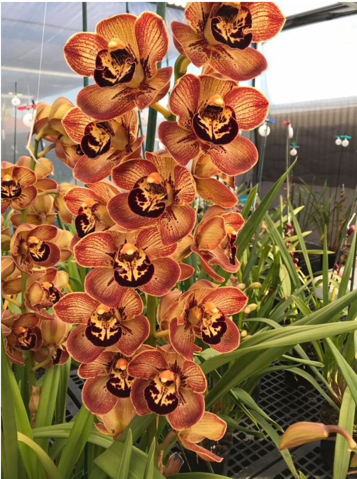
One of our favourites, Mesmerise 'Looby Loo', gets better with age, first of 4 spikes to open up.