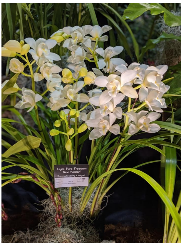
Cym Pure Freedom 'New Horizon'