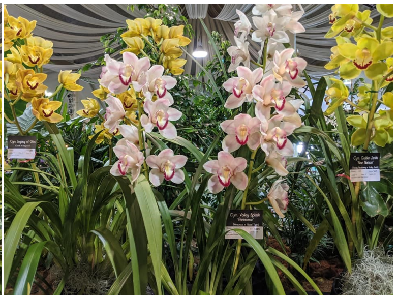
Cym Valley Splash 'Awesome'