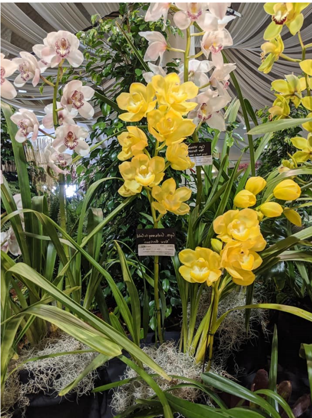
Cym Gateway to Gold 'New Horizon'