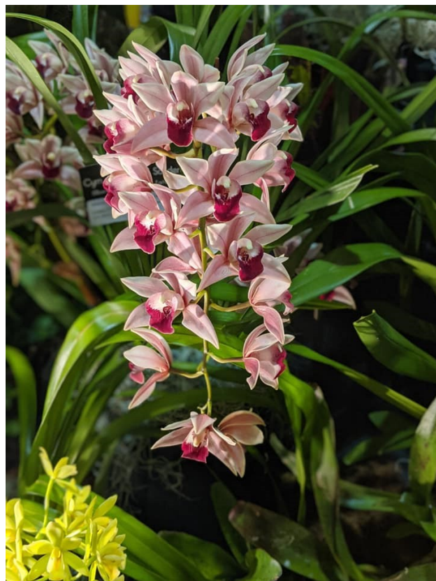
Cym Alba Odyssey