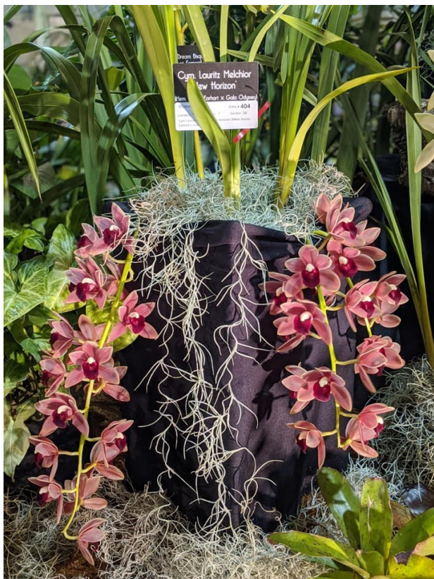
Cym Lauritz Melchior 'New Horizon'