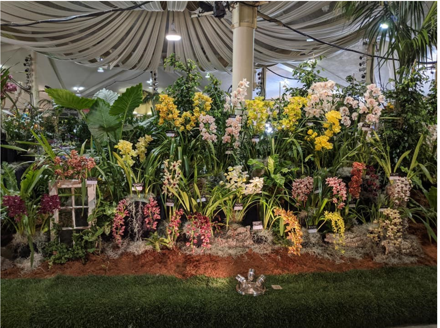
The Sorella Orchids display at Santa Barbara 2020