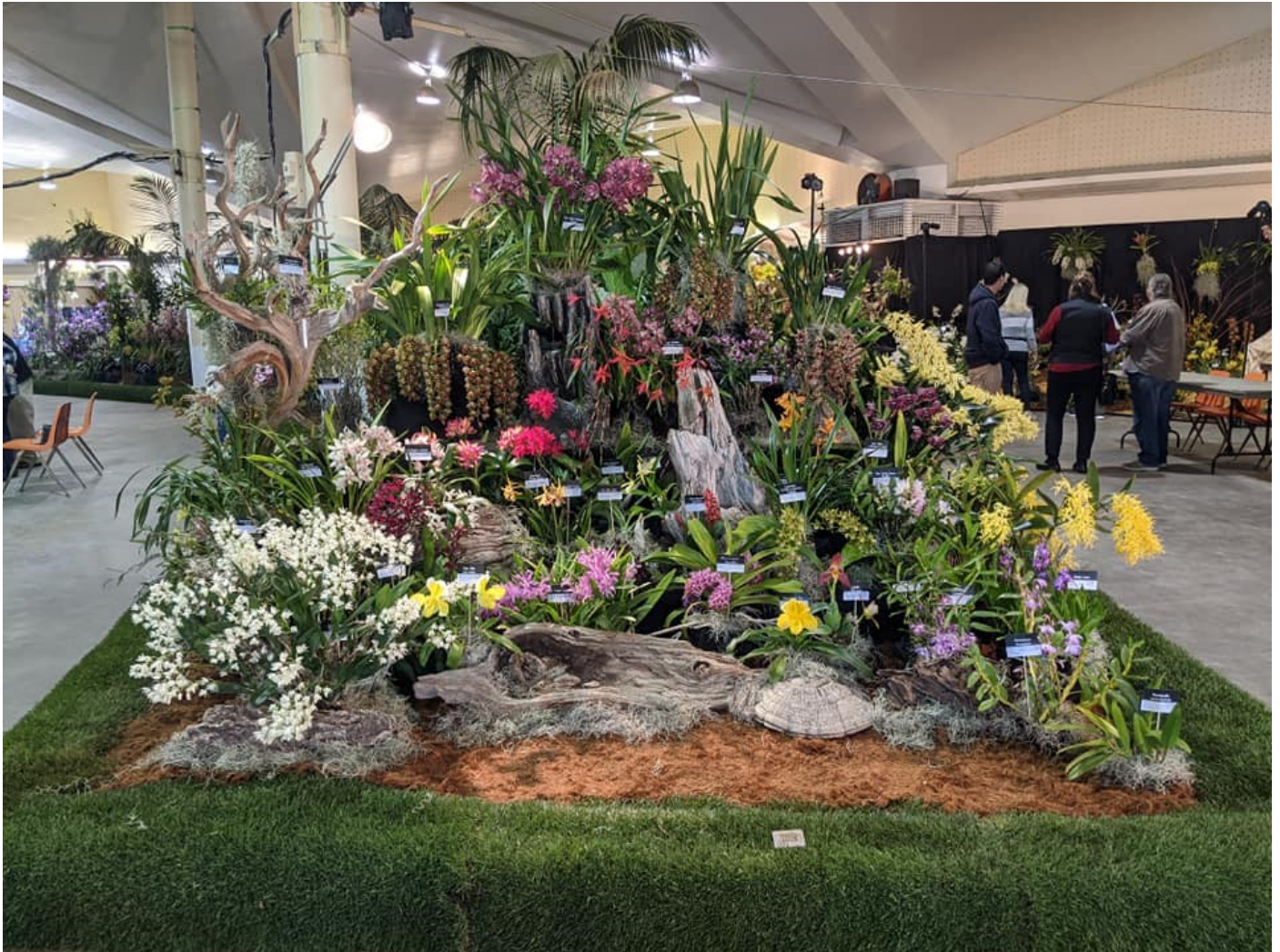
The Vietnamese Orchid Society display at Newport 2020